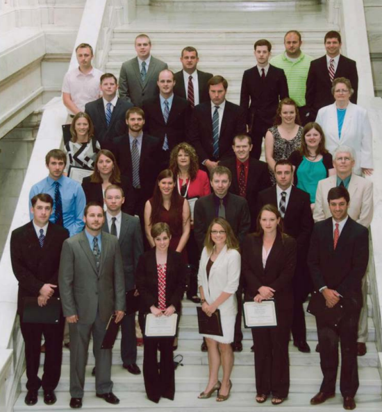
2013 Swearing-In Ceremony Honorees