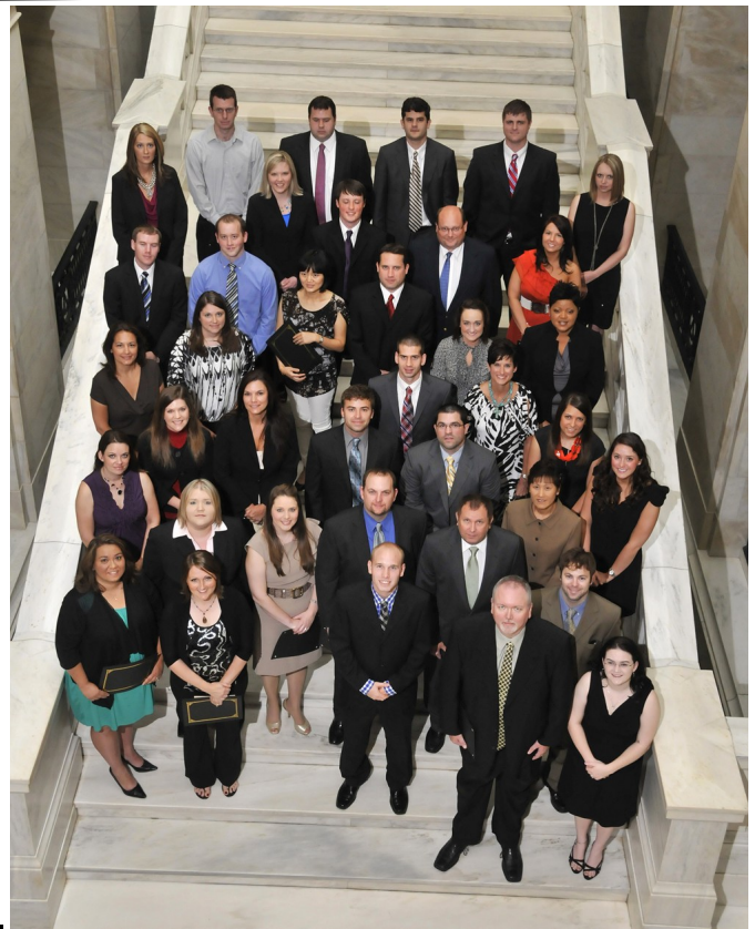
2012 Swearing-In Ceremony Honorees